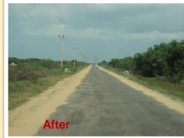
02. Murunkan Nanatan Road 7.25-7.50 (0.25 km)