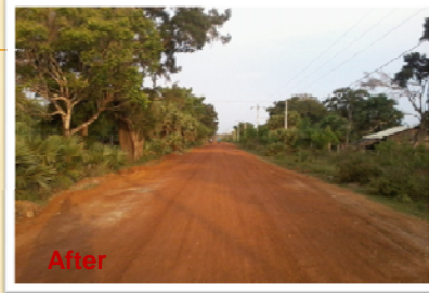
06. Vattapalai Keppapulavu Puthukkudiyiruppu Road 13.60-14.40 (0.80km)