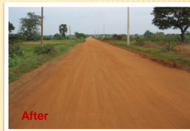
06. Madhu Palampitty Road 0.41-2.05 (1.64km) 1.98Mn