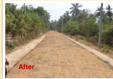
04. Polikandy navindl Karanavai 2.70-3.80 (1.10km)