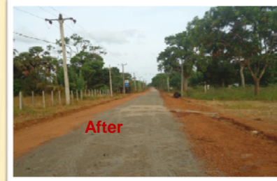
04. Uylankulam Adampan Road 4.53-5.65 (1.12km) 2.35 Mn