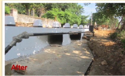
02. Madduvil Amman Road 0.00-0.48 (0.48km)