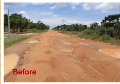
01. Murukandy Akkarayan Road 10.00-20.20 (10.20 km) 1.99 Mn