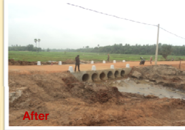
02. Thanduvan Periyakulam Road 1 No at 4.5 th km