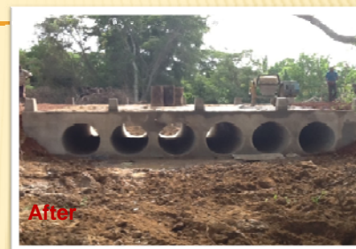
04. Poovarasankulam Thunukkai Road 40.00-51.50 (11.50km) 3.19 Mn