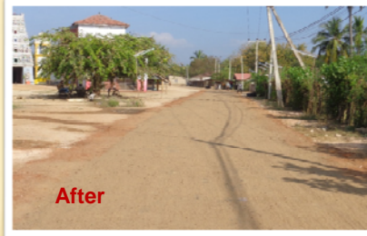
06. Mamunai Kaddaikadu 5.60-6.50 (0.90km)