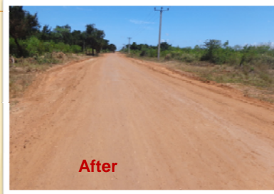
02. Vannerikulam Jeyapuram Road 0.00-7.60 (7.60km) 1.97 Mn