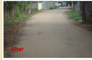
10. Meesalai Allarai Kachchai Road 0.00-0.43 (0.85km) 2.00 Mn