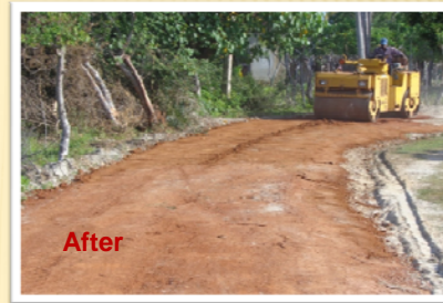
14. Somasundram Avenue Road 0.00-0.50 (0.50km)