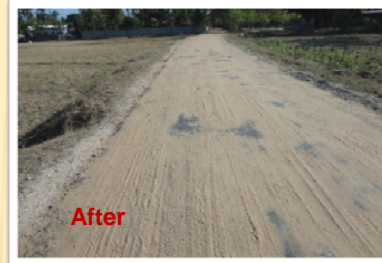
08. Chuddipuram Navatkadu Mirusuvil 0.80-1.00, 1.60-2.00(0.60km) 2.0Mn