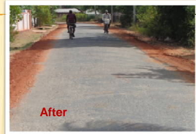
02. Sinnaputhukulam Road 2.00-6.92 (4.92km)