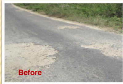
01. Maharampaikulam Housing scheme Road 1.00-2.00 (1.00 km) 1.90Mn