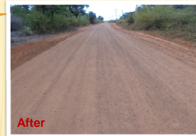
05. Rose Road 0.00-3.22 (3.22 km)