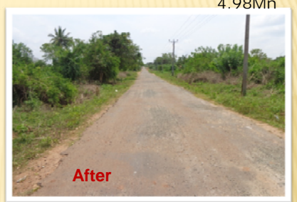
04. Nedunkerny Koolankulam Road 1 No at 1 st km